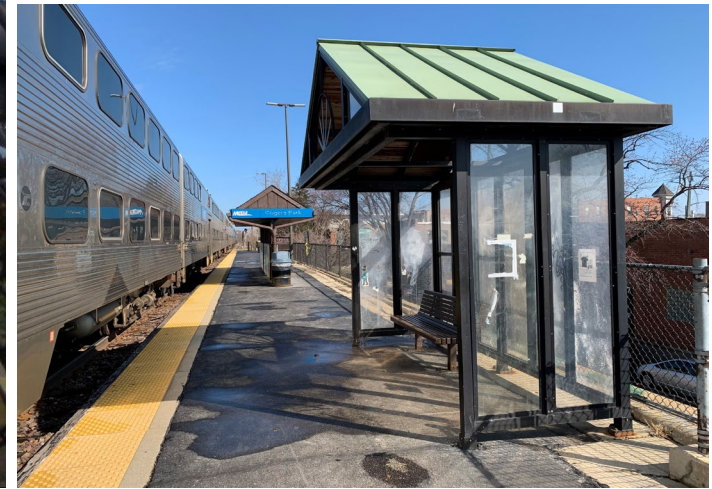
New 10 feet wide platforms.