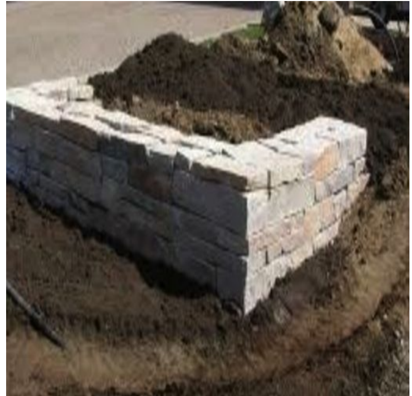
Example of envisioned upgraded material