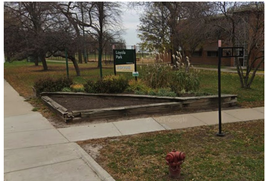
Current planter box