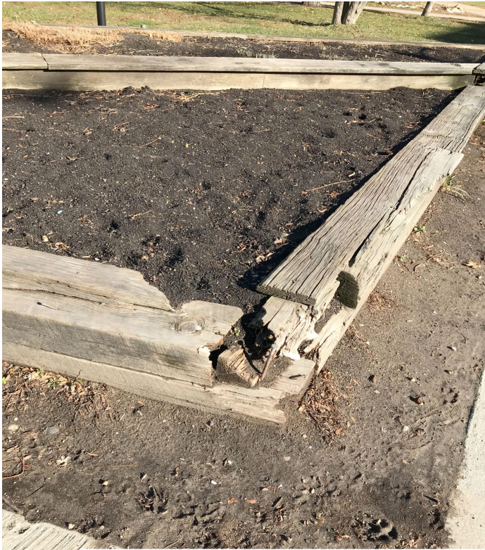
Current planter box